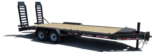
• Shown with optional large toolbox